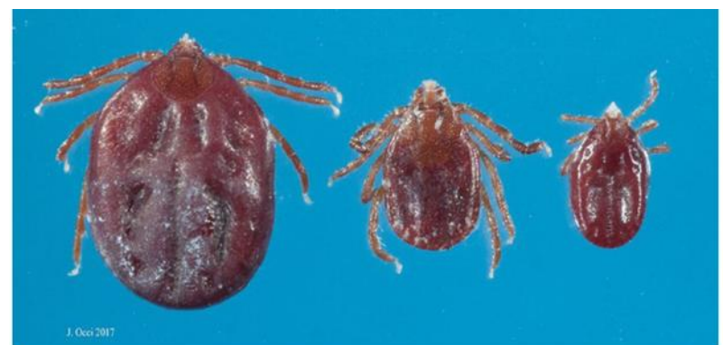
An engorged (left) and partially engorged (middle) adult females and an engorged larva (right) of the longhorned tick.

Unfed (i.e., flat) adult female longhorned ticks are completely medium (caramel-coloured) brown in colour, unlike the larger American dog tick and Rocky Mountain wood tick, which are a darker (chocolate-coloured) brown with white or ivory-coloured ornamentation on their backs. If you suspect any ticks of being Haemaphysalis , please contact one of the authors listed above, who can help coordinate their prompt identification. Ticks may be submitted in 70% ethanol or isopropanol (rubbing alcohol) – see the information at the link below.