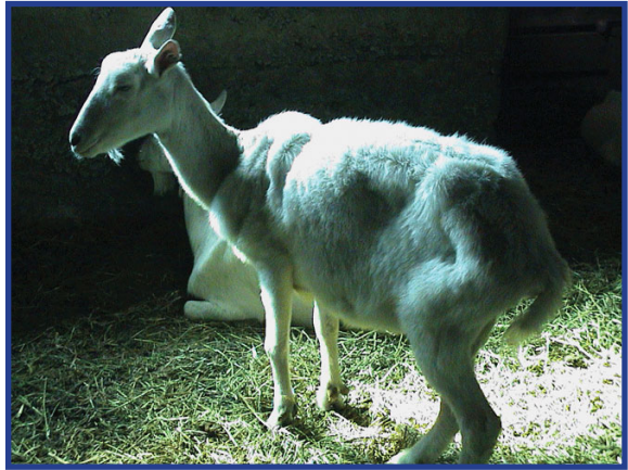
A goat showing symptoms of Johne's disease.

A: A goat that appears perfectly healthy can be infected with MAP . Although goats become infected in the first few months of life, many remain free of clinical illness until months or years later. When goats finally do become ill, the symptoms are vague and similar to other ailments: rapid weight loss and, in some cases, diarrhea. Despite continuing to eat well, infected goats soon become emaciated and weak.