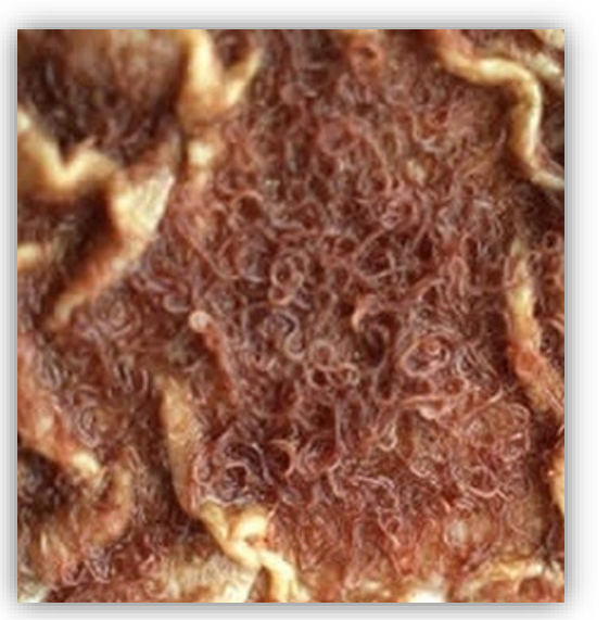
Haemonchus in the abomasum of a sheep.