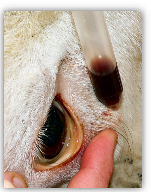
Photo above: Jaundiced sheep-notice the yellow color of the soft tissue of the eye. The tube shows the colour of urine.

CLINICAL SIGNS: The signs are vague: down, depressed, thirsty, teeth grinding (likely due to